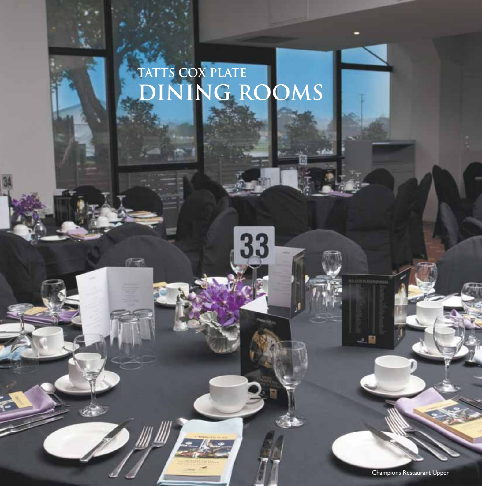
Champions Restaurant Upper